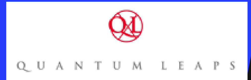
M. Nobuyuki Idei Founder & Chairman / Quantum Leaps Former CEO / Sony